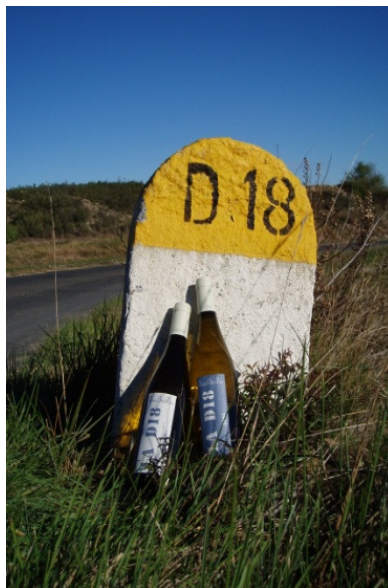
D18 for ever

Production : 2500 bottles Yield : 10hl/ha Surface : 2 ha