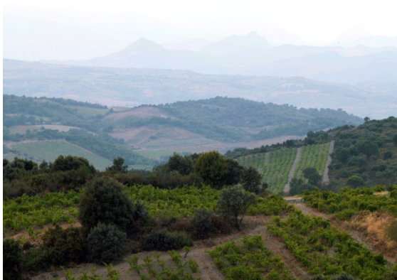
Bugarach in the mist from the D18

When you have borrowed the name of this road between Calce and Le Col de la Dona, you tell yourself that it works well, it's a good name for a cuvee. Above all for one which is uniquely based on a selection of the best slopes of White and Grey Grenache. These vines brought us such great satisfaction in 2001 that there grew the desire to explore all their richness and their complexity to make a great white wine. To grow and nurture thus wine in wooden vats for twelve to sixteen months, appeared to us the minimum we could do to bring out the density of these beautiful grapes.