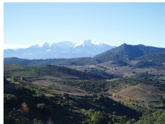
Canigou from the D18