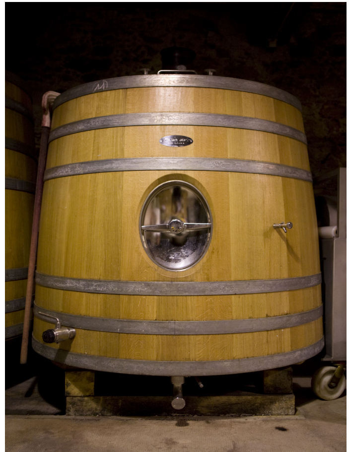
Barrels of Laïs

This wine is fermented for three to four weeks and then aged in barrels or large casks for 4 to 18 months according to the vintage. This allows all the richness and the complexity of these concentrated grapes to come out. But the concentration is not our only worry. We need to know how to capture the volume and the freshness and achieve a balance which satisfies us.